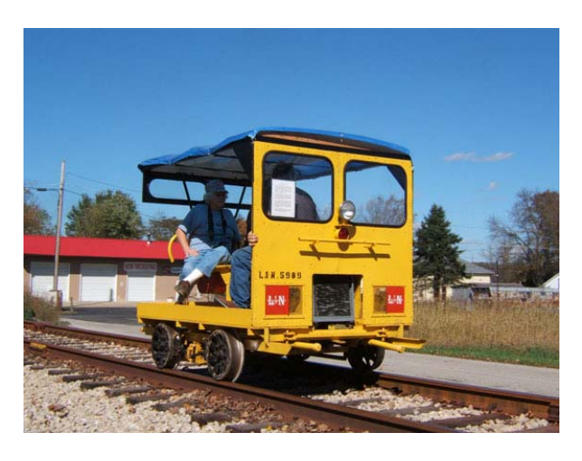
All I want for Christmas....! Editor