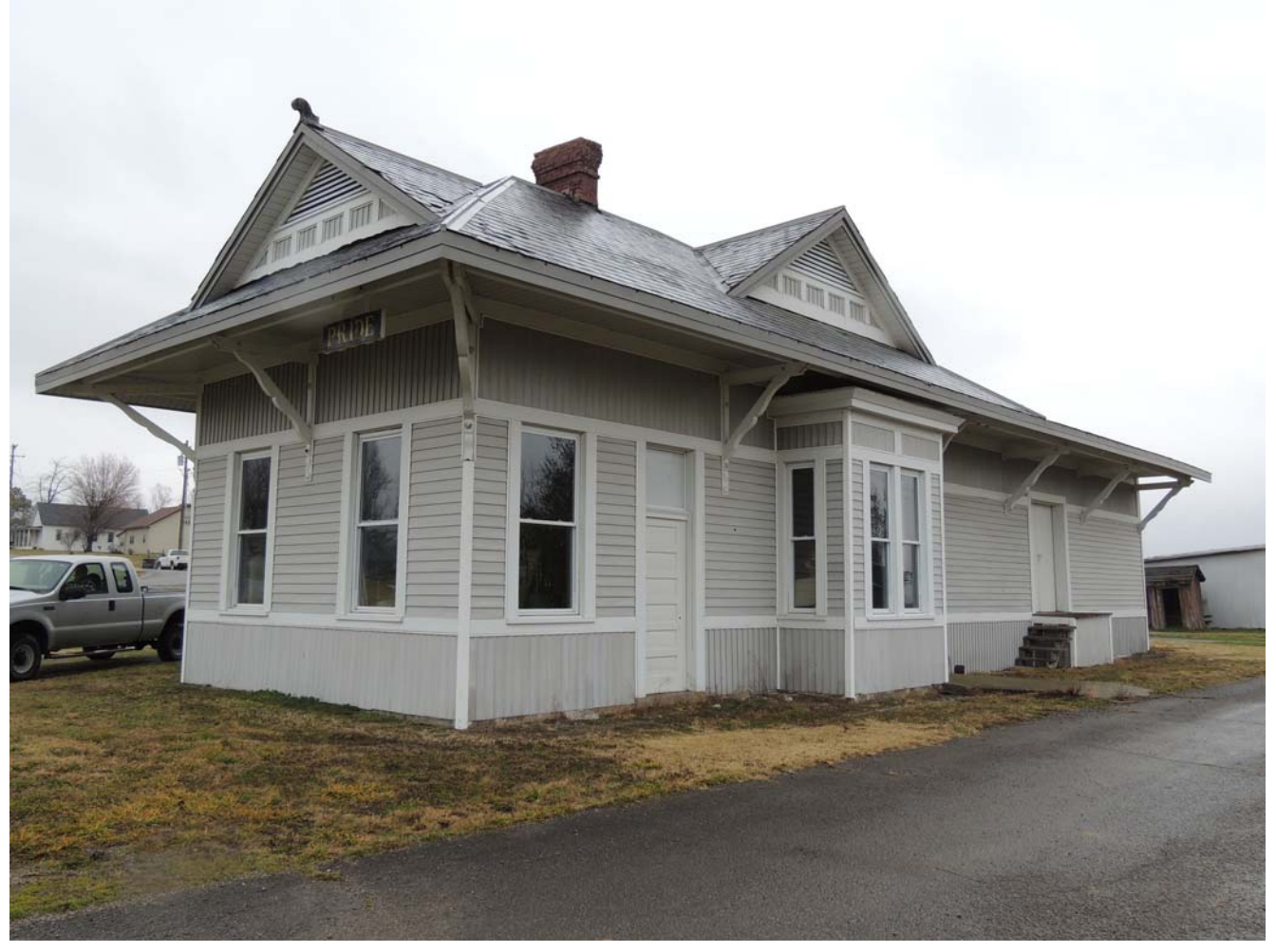
Above: The Pride Ky L&N depot still stands over 70 year after Morganfield branch abandoned.

Above: Here is Army Hospital Unit Car #89456 on its way from the Naval Ordinance Station in Louisville, KY to the Historic Rail Park in Bowling Green, KY. Read more at http://historicrailpark.com, or Google Kentucky Historic Rail Park.